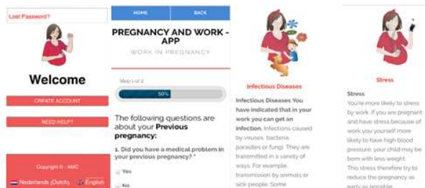
Figure 1: Description and examples of screenshots of Pregnancy and Work App: Welcome page, Questionnaire page, workadvice pages infectious diseases and stress

After creating a user account participants answered a few questions in the P&W app about their health, pregnancy and work. Based on these answers, each participant received an e-mail with an individual work advice. The home page of the app provided access to several topics: 'work advice', 'legal issues and tips for consultation', 'baby messages' about the growth of the unborn baby and 'more information'. The P&W app also contained a page for (obstetrical) caregivers, with all advices, classified by risk factor. At 20 weeks pregnancy users of the P&W app were asked to answer a few questions again, to check whether working conditions and health had changed. Participants received an adjusted work advice via the app and by e-mail if necessary. The P&W app is described in more detail in our previous study [18].