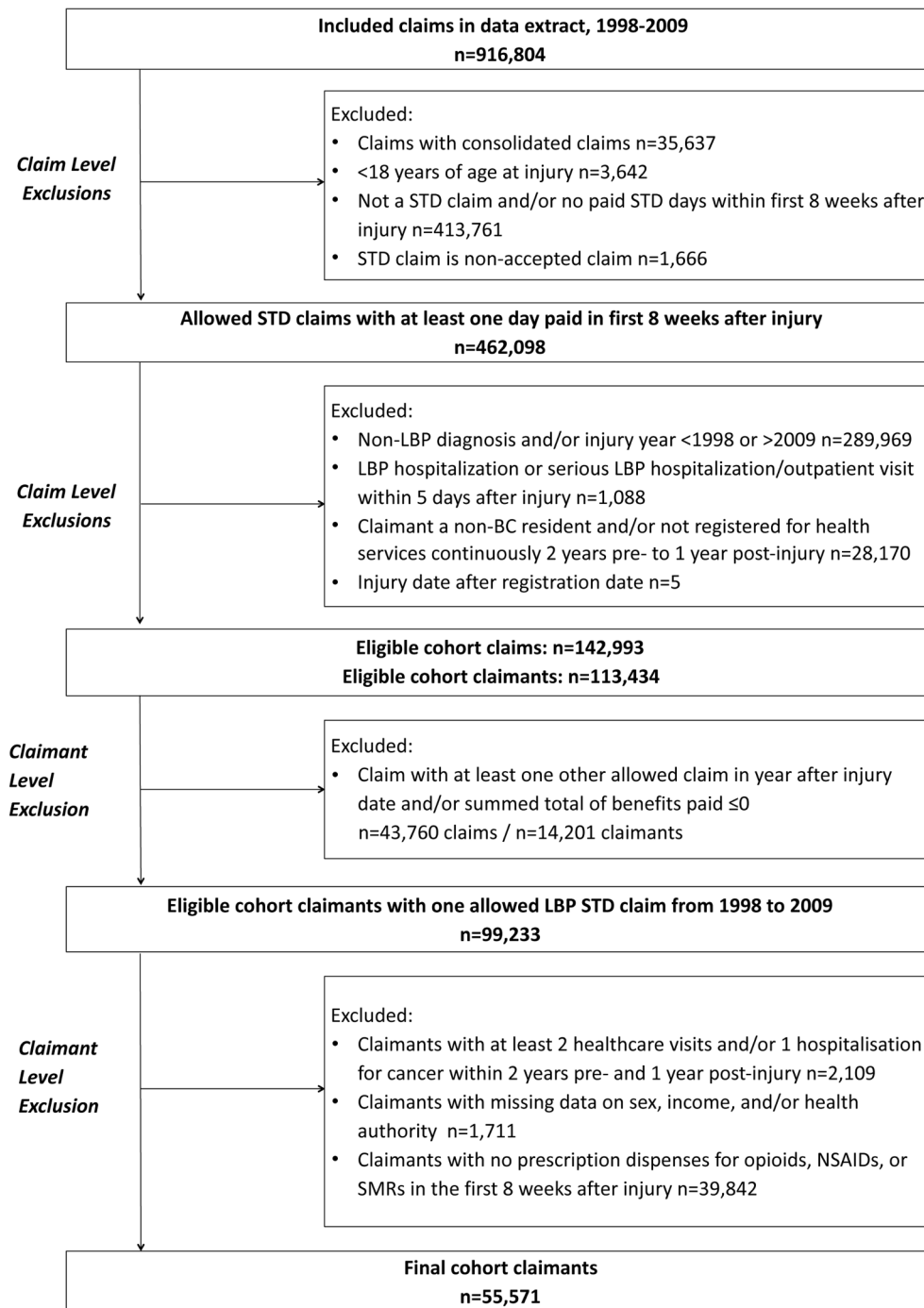
Figure 2 Claim-level and claimant-level exclusions to derive the final cohort sample of workers' compensation claimants with accepted low back short-term disability claims between 1998 and 2009. BC, British Columbia; LBP, low back pain; NSAID, non-steroidal anti-inflammatory drug; SMR, skeletal muscle relaxant; STD, short-term disability.