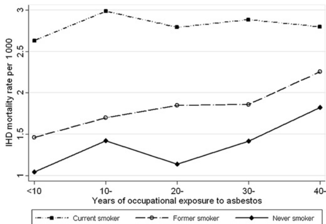
Figure 2 Ischaemic heart disease mortality by smoking status and duration of exposure to asbestos, adjusted for age, sex, job, and birth year.

There was also some evidence that the risk of mortality was positively associated with indicators of occupational exposure to asbestos; this was stronger for IHD. In Poisson regression analysis, the risks of CD and IHD were associated with job type and year of birth, and for IHD only, with duration of occupational exposure to asbestos. The evidence from studies of the effect of ambient air pollution is also stronger for IHD than for CD. 24