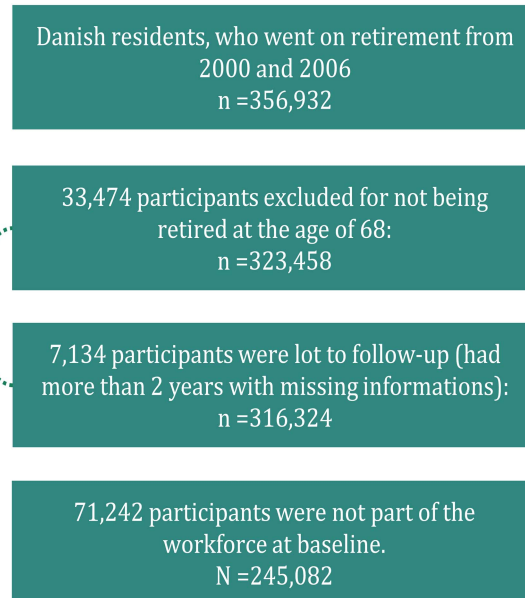
Figure 1 Flowchart of the study population.

During the follow-up period (2000–2006), three main types of retirement were available in Denmark: (A) old-age pension, available for all workers at the age of 67 and above. From 1 July 2004, workers born after 1 July 1939 could retire on old-age pension at the age of 65; (B) postemployment wage programme (PEW), available for qualifying workers from the age of