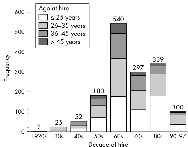
Figure 2 Number of male German workers, traced alive on 1 January 1976, by decade of hiring and age at hiring.

259 workers (16.9%) were hired before 1960. About one third of the study cohort was hired in the sixties, about 20% in the seventies and eighties each, and about 7% in 1990-97. The distribution of age at hiring seems to be similar over all