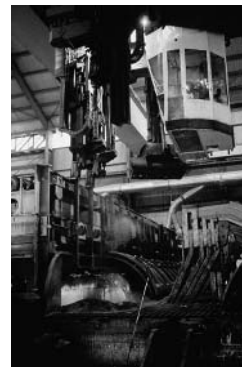
See p 989