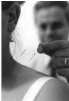
See p 141

NEW ONLINE SUBMISSION GO TO WEBSITE TO SUBMIT YOUR MANUSCRIPT